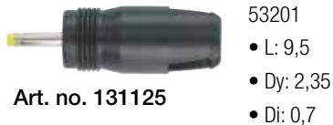
Art. no. 131125